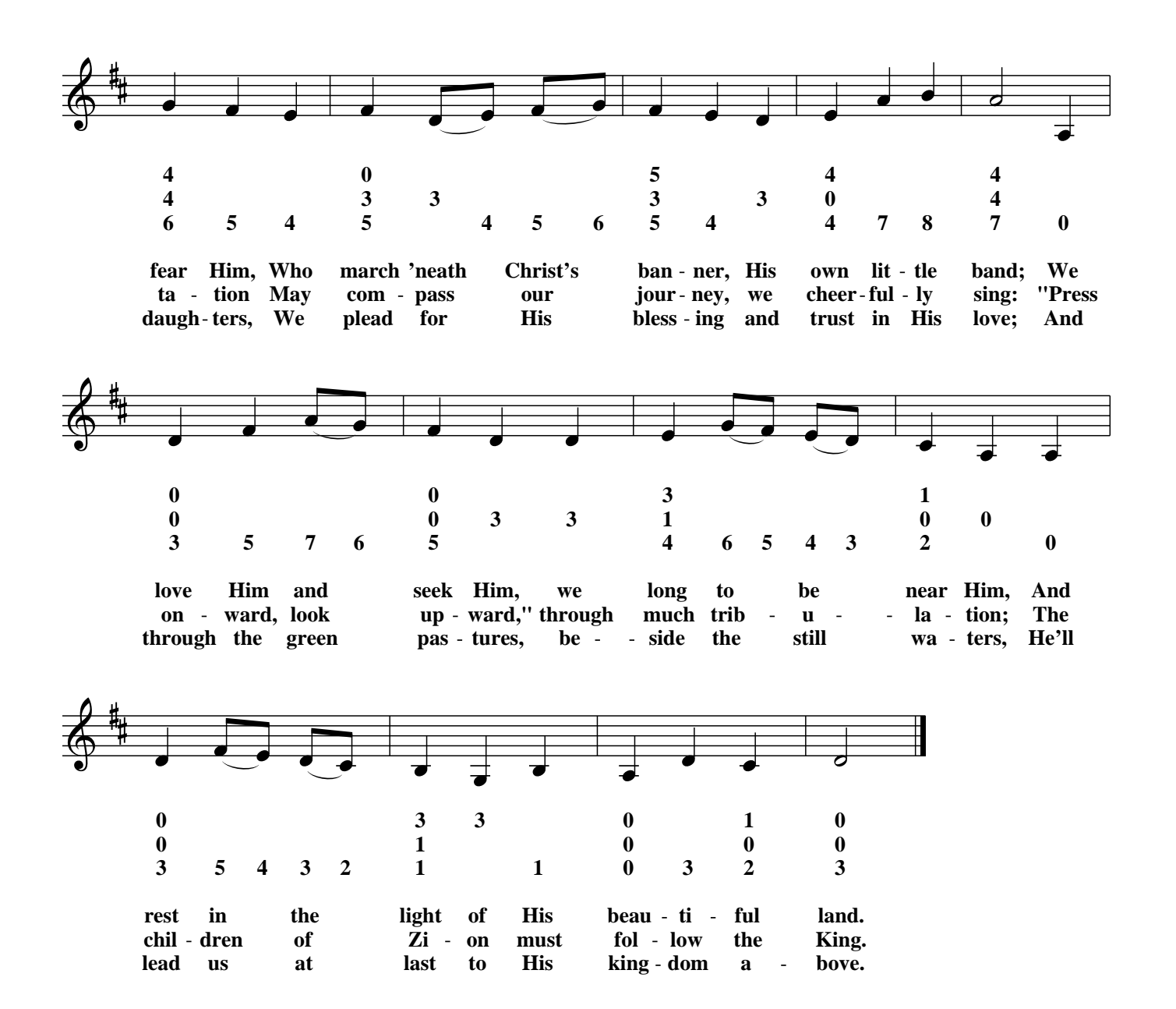
Music: The Ash Grove, 12,11,12,11D, a traditional Welch melody